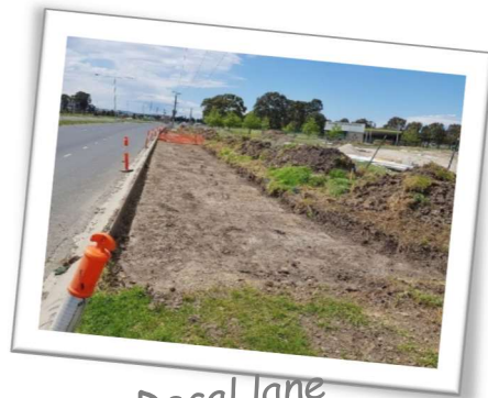
Decal lane preparation.....

There are a few options available and we will be calling on every member of