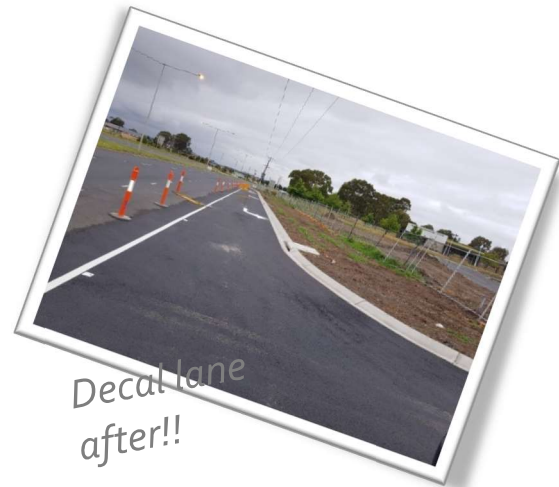
Decal lane after!!