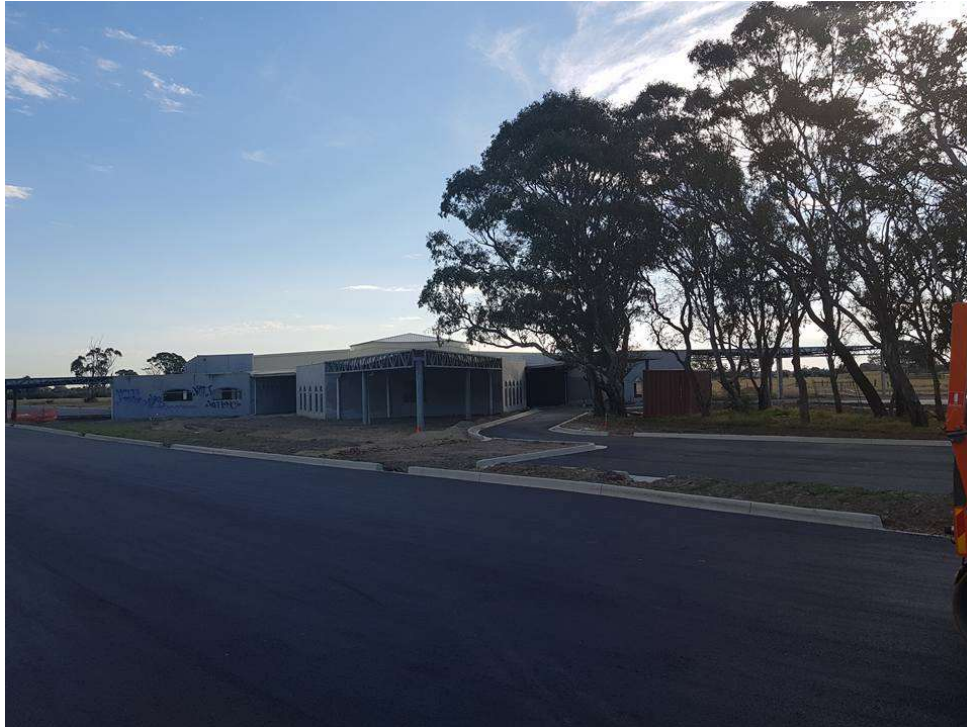
UNITARIAN DRUZE COMMUNITY CENTRE OF VICTORIA